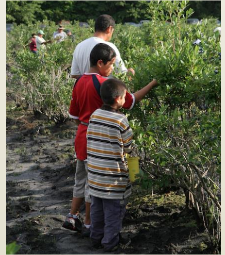
Hired youth farmworkers in North Carolina

During the summer of 2013, researchers interviewed 87 youth, ages 10-17, who were working on North Carolina farms. Over one-third (38%) of the youth were girls. Over three-quarters (78%) were born in the United States, and the majority (90%) identified as Latino or Hispanic. They worked in